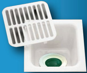
Device in Floor Sink

FloorSink DEFENDER's proprietary bacterial compound puck that is a non-caustic, pesticide-free, all-natural, organic compound composition that turns fats, oils, and grease into carbon dioxide and water.